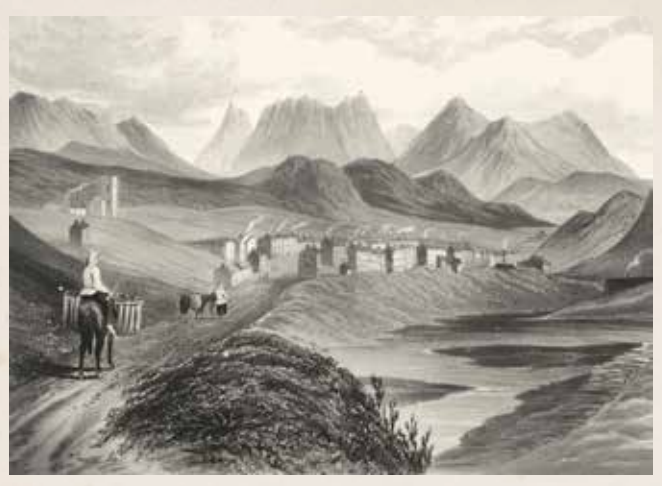
Clifden Town in the early 1800's